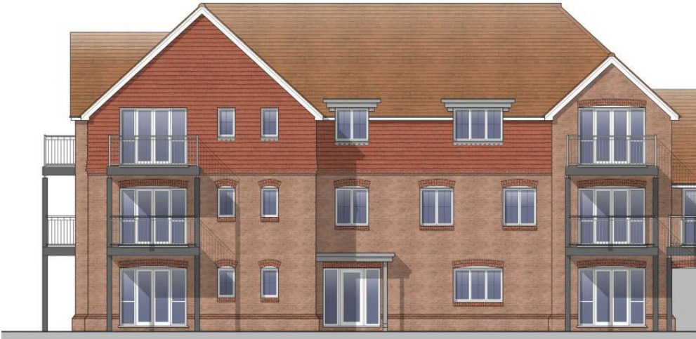
Building 7 - Front Elevation

In contrast the Reserved Matters application includes apartment blocks that are fully 3 storeys high as shown below.